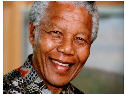
Public signage from apartheid-era South Africa; Protest against white-only minority rule; Iconic human rights leader and South African President, Nelson Mandela.